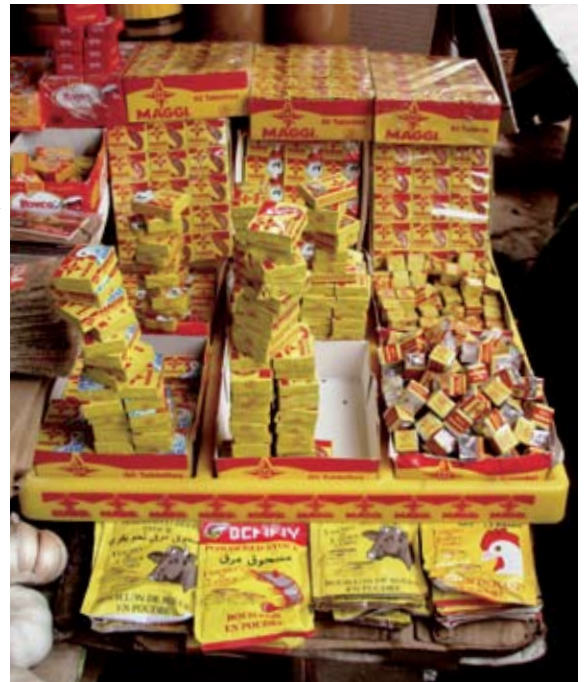
In most countries, the Maggi seasoning cube contains iodized salt

There are challenges to using iodized salt, however, the main one being the variations of regulations in trade regions. For example, in Europe, which has the highest prevalence of IDD according to WHO, some coun-