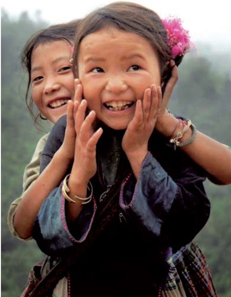
Kyrgyzstan children will benefit from better access to iodized salt

UNICEF, Bishkek, Kyrgyzstan, 30 June 2011. Despite improvements in the past decade, 22 per cent of all deaths among children under-five in the Kyrgyz Republic are still caused by undernutrition, according to a report launched today. Besides the loss of lives, the burden of undernutrition in the Kyrgyz Republic is also substantial in economic terms, and is estimated to be US$32 million annually. Scaling up nutrition interventions, including iodized salt coverage is therefore crucial to prevent loss of children's lives and is a strategic economic investment with high returns, according to the Situational