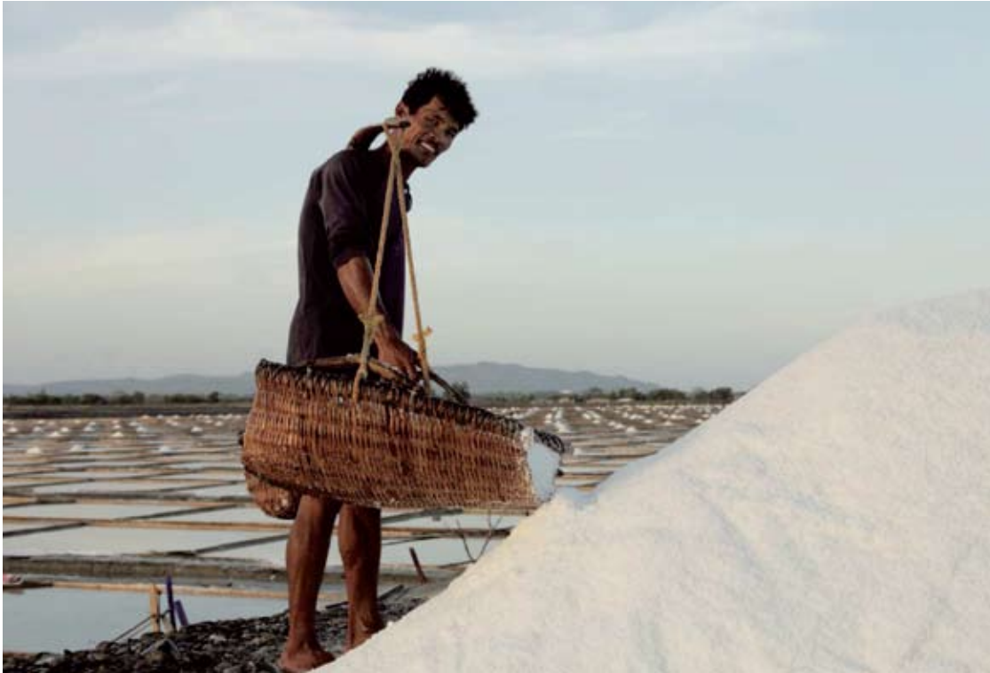
Salt farmer in Mindoro, the Philippines