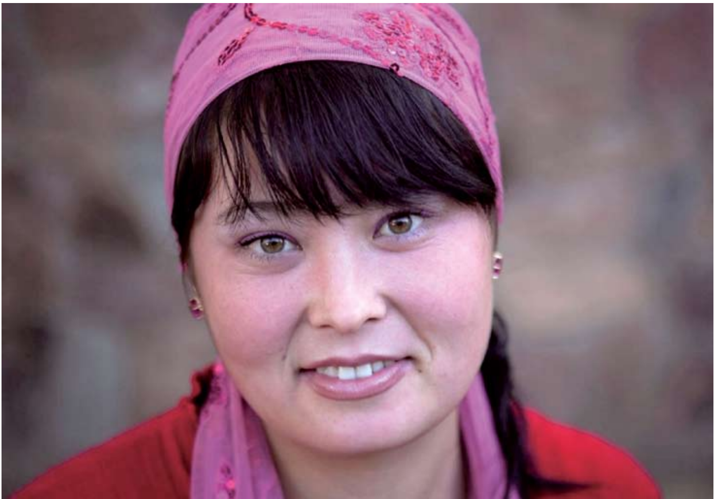
USI ensures adequate iodine for Kazakh women

The elimination of iodine deficiency through USI is a major public health triumph for Kazakhstan. The letter from The Network for Sustained Elimination of Iodine Deficiency certifying the elimination of IDD in Kazakhstan is shown on the following page.