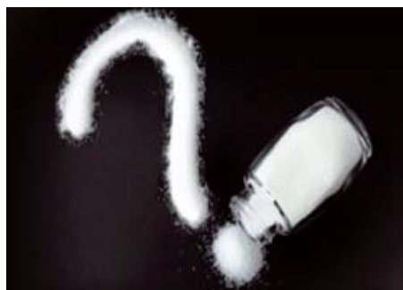
Salt is the ideal vehicle for iodine fortification in most countries, but high sodium intakes have been linked to hypertension

Trends in consumption are changing. In industrialized countries, approximately only 15% of daily salt intake comes from table salt, while in many developing countries or more remote regions salt is added at household level, thus making it the source of sodium in the diet.