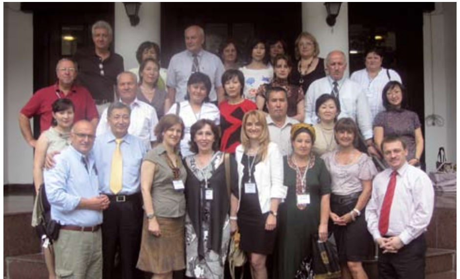
Participants at the Almaty Workshop for Iodine Labs in the CEE/CIS Region

Salt producers conduct internal quality assurance of iodized salt production by overseeing the usage of potassium iodate and its addition into food grade salt during processing, combined with regular conduct of qualitative spot tests or quantitative measurements in production-based laboratories. The salt producers and traders are united in a National Association of Salt Producers, which represents their interests and reports on the national production statistics. Salt inspections in wholesale and retail markets as well as residential catering institutions are carried out by the Sanitary-Epidemiological Supervision (SES) authority, and the results are linked to obligatory quarterly reporting to the Chief Health Inspector of the Ministry of Health.