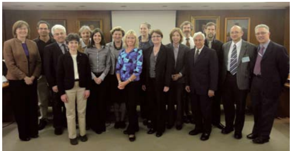
Participants in the meeting “Improving public health through the optimal intake of iodine and sodium” at Pan American Health Organization (PAHO) in Washington D.C., March 31 to April 1, 2011

In early 2011, PAHO convened a meeting of experts and stakeholders to discuss the potential for collaboration between these programs in the Americas and discuss how this could be taken forward (see photo). With the goal of securing optimal salt and iodine intake in the Americas, the intent was to bring together the state of public health knowledge and experience in iodine fortification and salt reduction in order to draft an outline of a framework for colla-