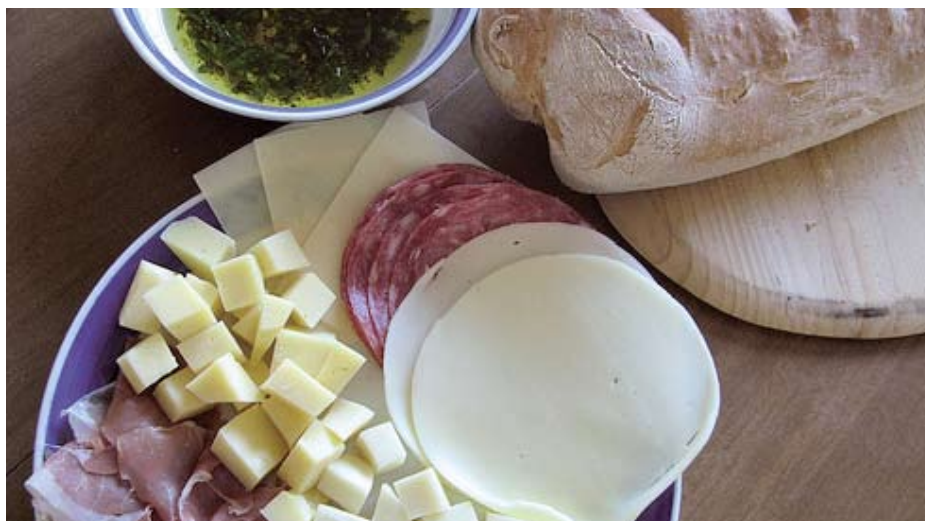
Iodized salt does not change the color or taste of processed foods

This presentation gave the highlights of the results of an IFT study (funded by The Micronutrient Initiative) to determine the use of iodized salt in processed foods worldwide and food processors' knowledge of iodine nutrition. Phase 1 of the project looked into the consumption of processed foods in 39 countries around the world and gathered information on the types of processed foods consumed, including their sodium content, and also the levels of consumption by different socio-economic groups. As well, major food processors and